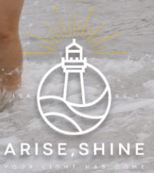
Retief Uys & family 16 February 2025