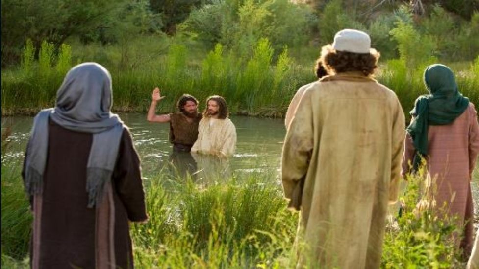
Baptised (age 30)