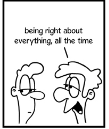
Comic Title: False Christian Humility