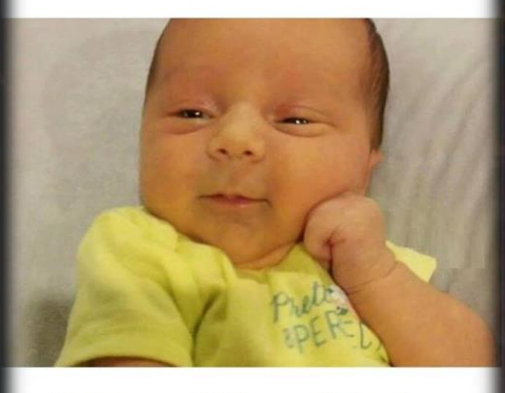
But you still keep listening

When someone is telling you a lie when you already know the truth