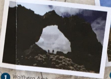
1 Wolfberg Arch, a rewarding 12km (8 hour) return hike from Sanddrif