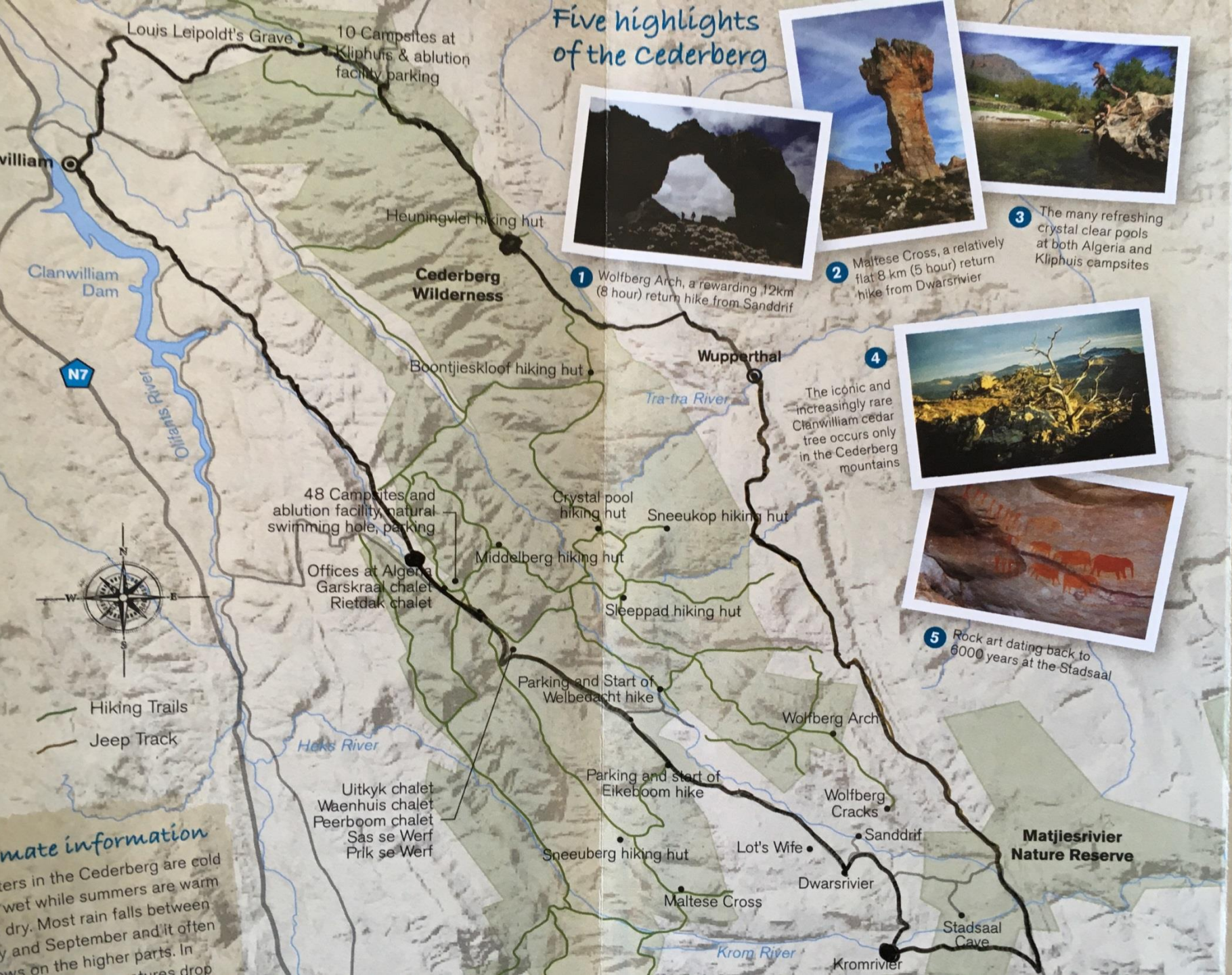
Rock art dating back to 6000 years at the Stadsaal