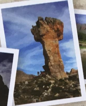
2 Maltese Cross, a relatively flat 8 km (5 hour) return hike from Dwaarsrivier