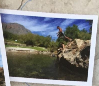
3 The many refreshing crystal clear pools at both Algeria and Kliphuis campsites