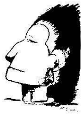
A Face Of A Native American... Or An Eskimo?