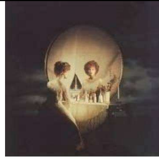
Woman In Vanity... Or Skull? hint: move farther a bit from the screen and blink to see the skull or the woman (looking at the mirror)

Left - Right Conflict Your right brain tries to say the colour but your left brain insists on reading the word.