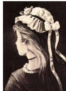
Old Woman...Or Young Girl? hint: The old woman's nose is the young girl's chin.