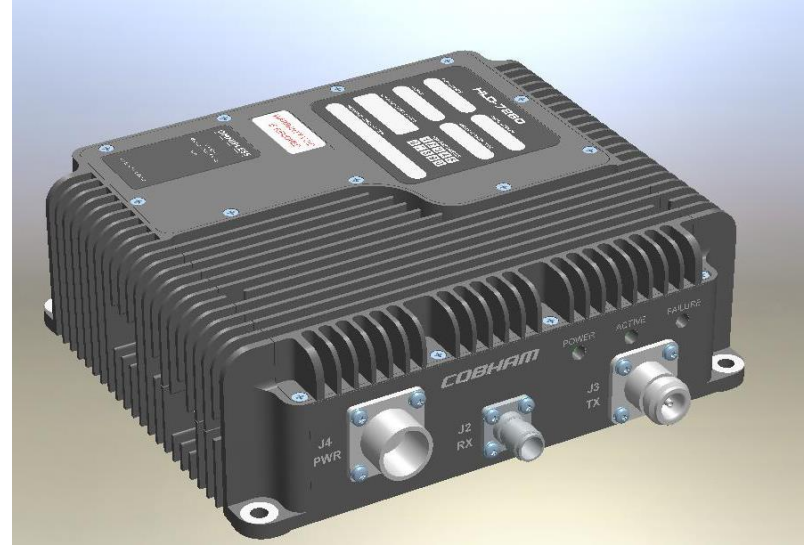
7 th iteration